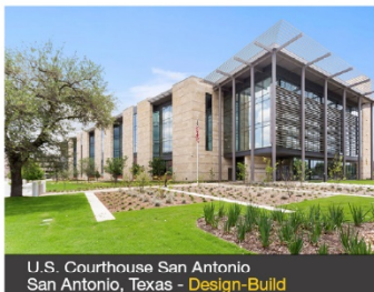
U.S. Courthouse San Antonio San Antonio, Texas - Design-Build