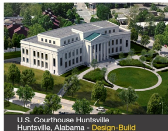
U.S. Courthouse Huntsville Huntsville, Alabama - Design-Build