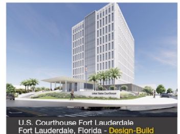
U.S. Courthouse Fort Lauderdale Fort Lauderdale, Florida - Design-Build