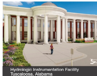
Hydrologic Instrumentation Facility Tuscaloosa, Alabama